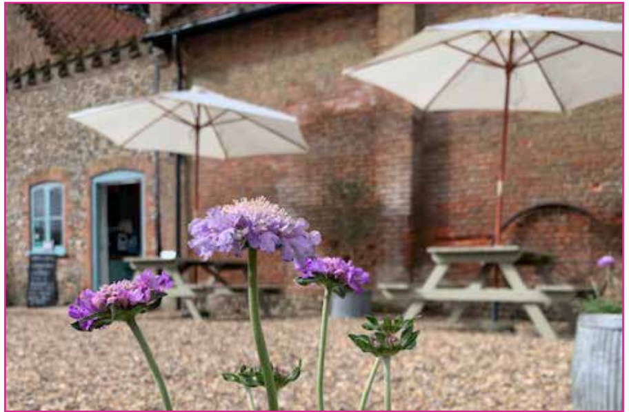
Outside tables at The Hen House

regulars back enjoying the revamped shop, but also we've been really pleased to welcome so many new customers too, many of whom had not visited Wymondham before.