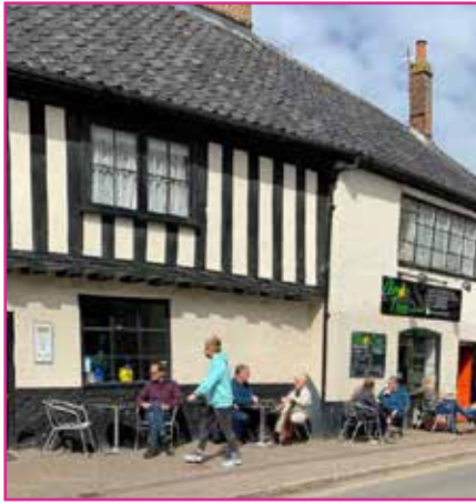
Customers back outside The Lemon Tree