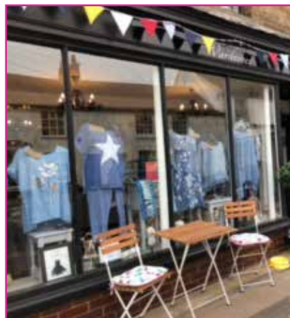
Wardrobes sporting colourful bunting

"The re-opening was not as manic as last summer but I have already welcomed back lots of my regular ladies. Although the weather has been dry and bright, the temperatures sadly have not reflected this - but once they improve I have no doubt that the town will be even busier with both regulars and visitors."