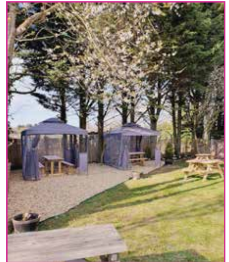
Seating under the blossom at the Station Bistro