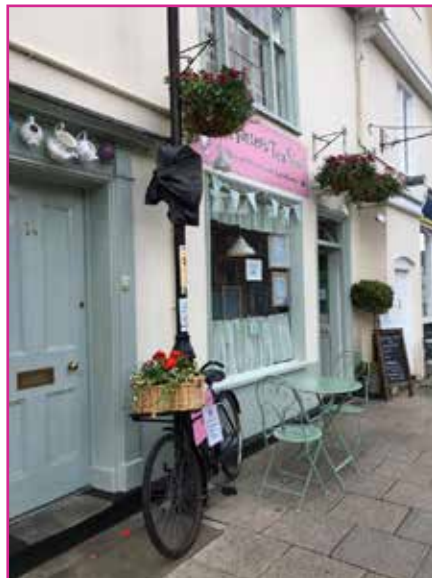
Seating fit for afternoon tea at The Mad Hatters

"The first week went brilliantly, not chaotic like we had imagined and the response from customers was lovely, many eager for some retail therapy too. It's been great to get some normality back. Local support over the past year has been phenomenal and we will be forever grateful.