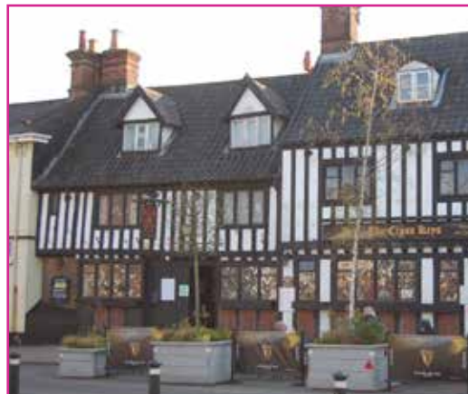
Enjoying a pint outside The Cross Keys

"We are having a phased re-opening starting with a two-day week working up to a five-day week in order to readjust and ensure good service," adds Kathryn Ford of the Mad Hatter's Tearoom opposite the Market Cross.