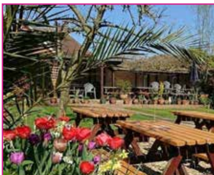
The Green Dragon garden

Most of the town's pubs have duly thrown their doors back open, with the exception of The Feathers on Town Green, which is planning to open on Tuesday 18th May, and The Railway near the station, which intends to re-open on Wednesday 19th May. Wymondham's pubs have made a huge effort to provide comfortable outside dining space to comply with regulations, with The Queen's Head notably launching a new covered