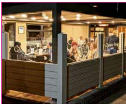
The new outdoor terrace at The Queen's Head

M onday 12th April was a day of celebration for the businesses of Wymondham, as the Government eased restrictions as part of their roadmap out of lockdown. Non-essential shops were allowed to re-open, and hospitality venues were permitted to serve customers outdoors, with no need for them to order a substantial meal with alcoholic drinks and no curfew.