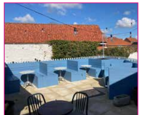
Colourful outside seating at The White Hart

Some businesses managed to offer a takeaway service during lockdown, including The Lemon Tree on Damgate Street. Manager Aideen Summers is pleased now that customers are able to sit outside the café. "It's been great to have people sitting outside again. Good to hear people happy and laughing - fingers crossed the sun stays shining! It's also so lovely to have our other businesses back open in the town." >